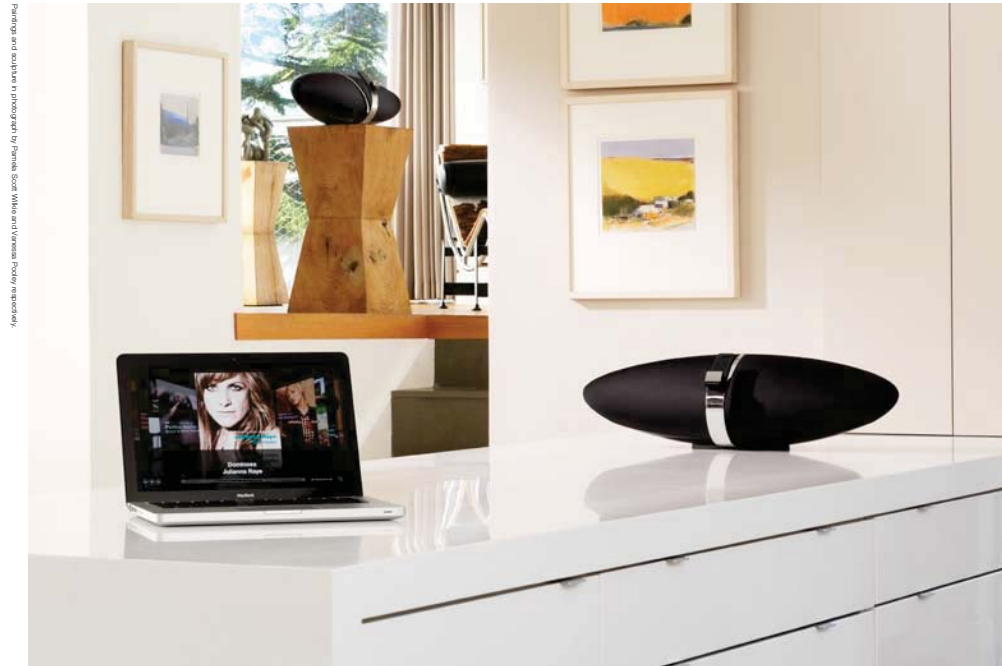
Photographs and sculpture in foreground by Perribe Scott. White and Venetian Pink® are trademarks.

Versatility AirPlay functionality lets you wirelessly stream music direct from your Mac/PC to Zeppelin Air. You can also stream audio from an iPad, iPhone or iPod touch. And not just music in your collection: the soundtrack to games, music from streaming music services or podcasts can all benefit from the amazing sound of Zeppelin Air.